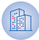
Buying a house or land for construction